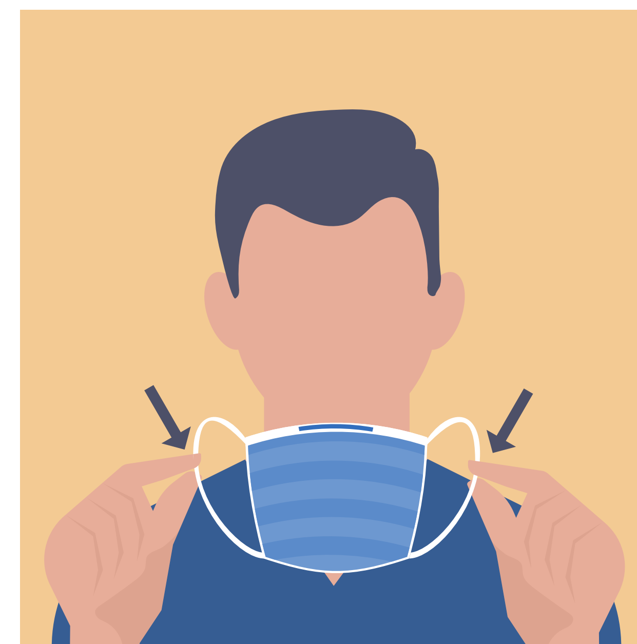
REMOVE THE MASK FROM BEHIND BY HOLDING THE STRINGS WITH HANDS