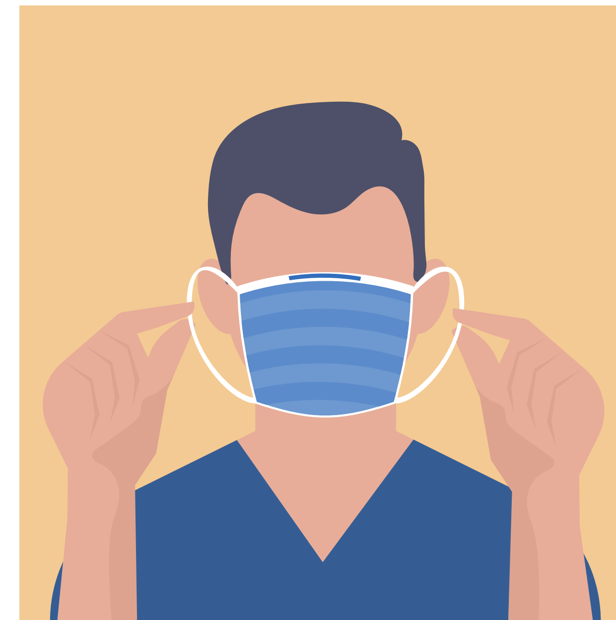
SECURE THE STRINGS AROUND YOUR EARS