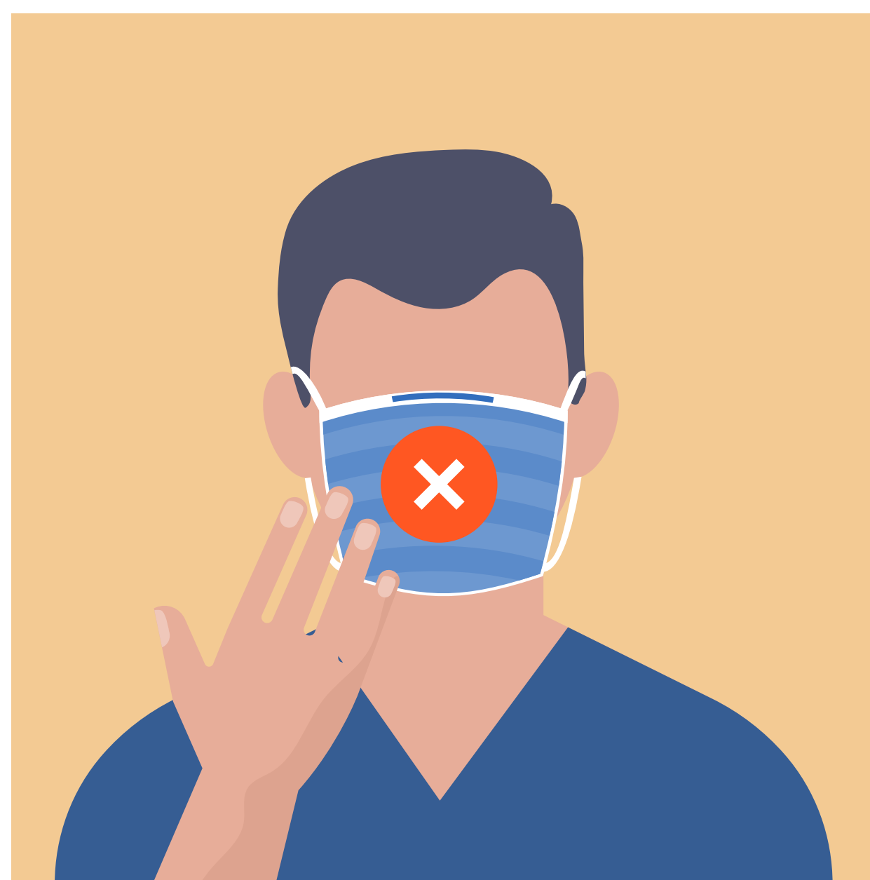
DO NOT TOUCH THE MASK WHILE USING IT