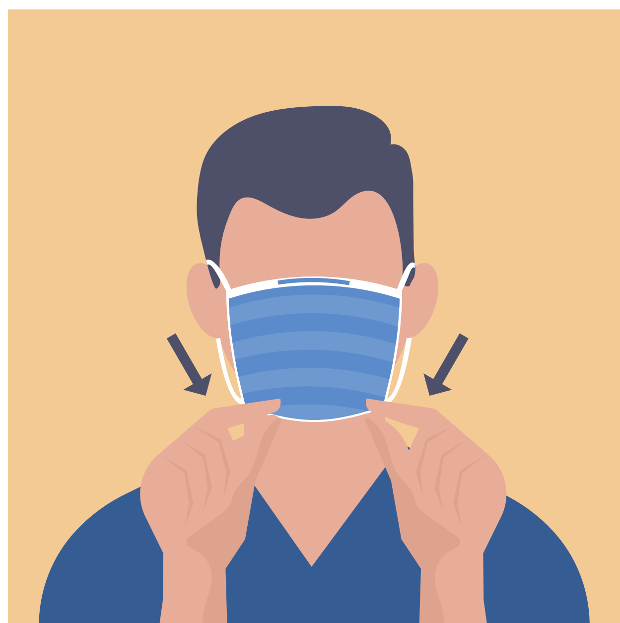
STRETCH THE MASK TO COVER YOUR CHIN