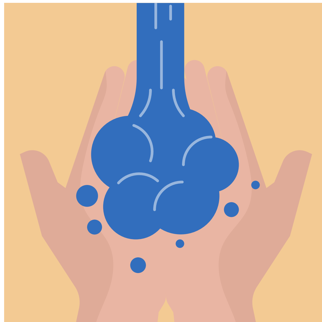
WASH YOUR HANDS BEFORE WEARING A MASK