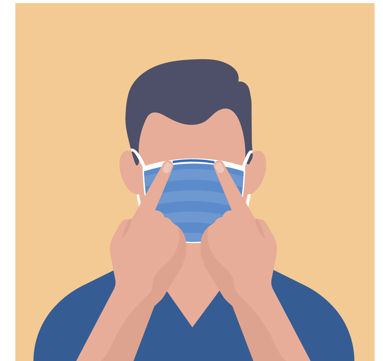
FIX THE METALLIC STRIP TO FIT OF THE SHAPE OF YOUR NOSE